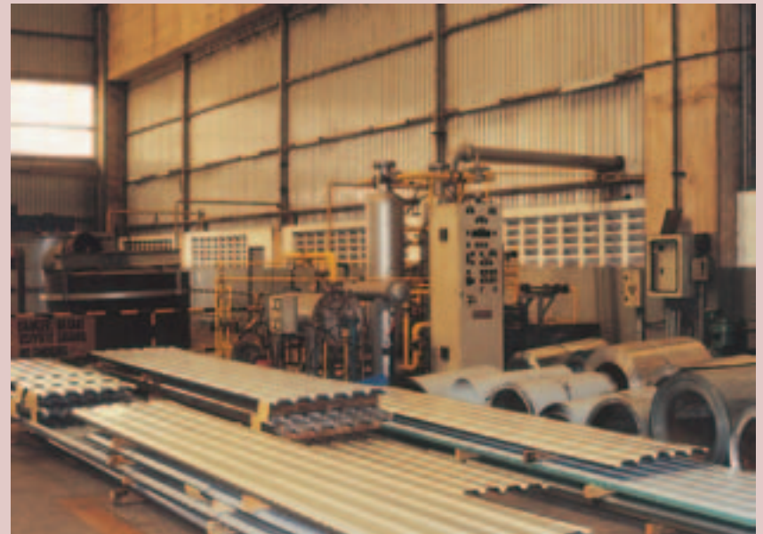
ALUMINIUM AFRICA LTD.: Buy Tanzanian, build Tanzania!

private sector-led mining industry that is conducted in a safe and environmentally sound manner. We also hope to bring benefits to the local people through community-based developments, such as roads, water projects and hospitals."