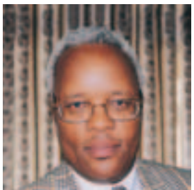
EDWARD LOWASSA Minister for Water and Livestock Development

At the same time, the TPC is anxious not to lose sight of the important social role it plays in providing a country-wide service that meets the needs of even the most remote settlements.