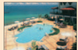
Zanzibar Serena Inn