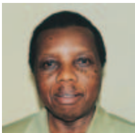
BASIL MRAMBA Minister of Finance

Mr. Ballali believes that Tanzania offers one of the most favorable environments for potential investors in Africa. Its wide range of incentives, abundant natural resources and favorable labor conditions all make Tanzania an attractive destination for foreign direct investment. "We need to raise investment beyond current levels if we are to achieve our targeted growth rates. Investors that come to Tanzania will find a new country fully committed to a market economy," concludes Mr. Ballali.