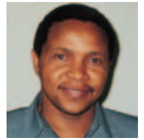
JAKAYA M. KILWETE Minister of Foreign Affairs and International Cooperation