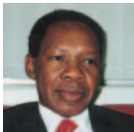
DAUDI T.S. BALLALI Governor of the Bank of Tanzania