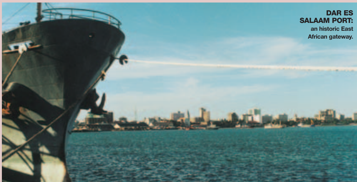
DAR ES SALAAM PORT: an historic East African gateway.

According to the IMF, the republic is one of just five African countries which are expected to continue attracting investment and long-term economic growth because of sound macro-economic and structural policies.