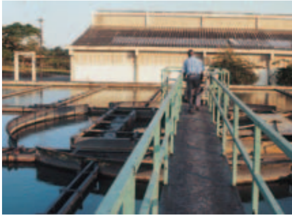
DAWASA is a prime target for investment, which will be used to update existing plants and improve rural coverage.

Since its inception nearly ten years ago, the government's privatization program has seen some