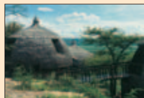
Serengeti Serena Safari Lodge