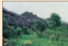
Ngorongoro Serena Safari Lodge

The very best of East Africa is beautifully captured and showcased in Serena's luxury resorts, safari lodges and hotels. Serena offers unmatched luxury and comfort in a way that will suit and expand your horizons. Always sensitive to the continent's wildlife and fragile habitat, Serena is an ecotourism pioneer and has initiated major environmental programs throughout the region.