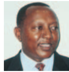
FREDERICK TIUWAYE SUMAYE Prime Minister

Another of Tanzania's attractions is its enviable track record of political stability and the role it plays in promoting peace in what has often been a troubled region. Tanzania enjoys good relations with the U.S. and the government believes that stronger economic ties between the two countries will be of vital importance in helping it to achieve its aim of sustainable growth. As Minister of Foreign Affairs Jakaya M. Kilwete confirms, "the relationship between Tanzania and the U.S. is now better than ever."