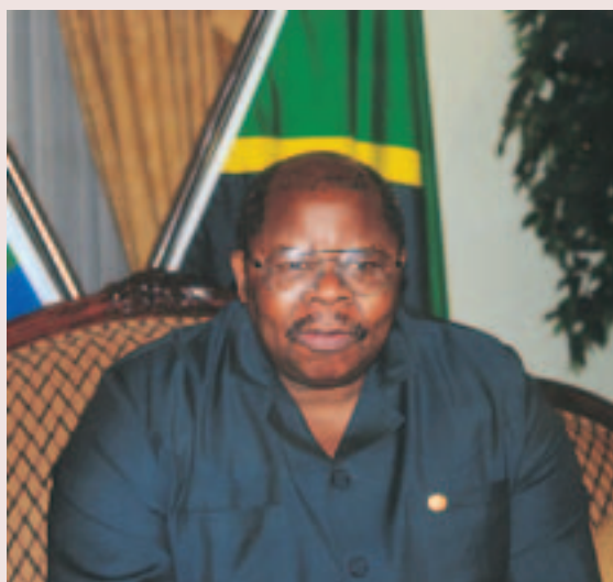
BENJAMIN WILLIAM MKAPA President of Tanzania

Here is a nation that is at peace with itself and at peace with its neighbors. It has a government that is well-founded democratically and one that has created a positive environment for investment, a government that is seeking to actively involve the population in the development of the country.