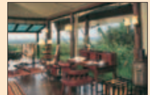
Kirawira Camp Western Serengeti