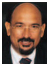
NELSON ODUBER Prime Minister of Aruba

We are working to improve the service and quality that we offer—this is the direction we are going in now. We are looking for investors for premium hotels in the private sector. We want to invest more in our communications, airport and service industry. We recently took a $100 million investment commitment. Announcing investment like that is great, it inspires confidence. Last week I had investors interested in Aruba from Hong Kong. This is impressive. They see the potential in Aruba. They want to come with a different concept of tourism.