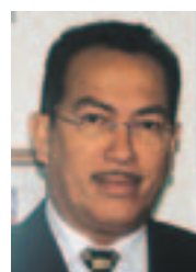
EDISON BRIESEN Minister of Tourism & Transportation

A great place to soak up the sun, but there are plenty of activities on offer too