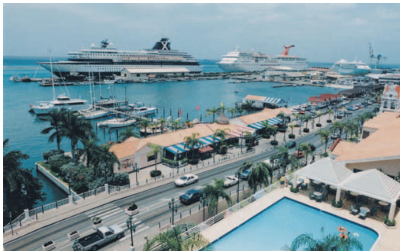
Oranjestad is a regular port of call for giant cruise ships. Aruba Ports Authority is also looking to develop the island's cargo business